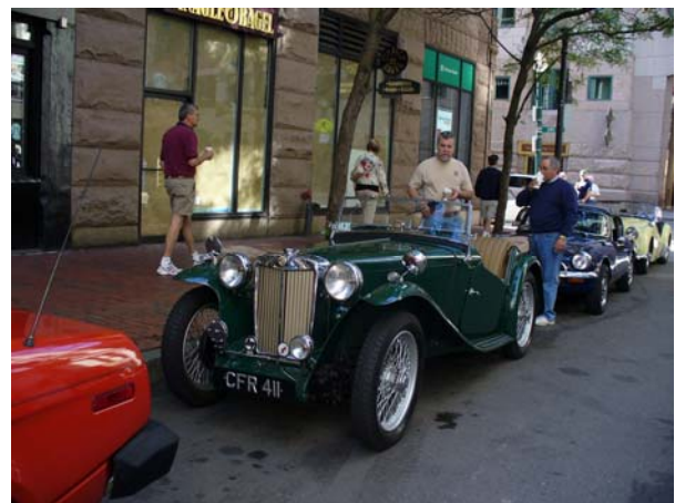
Staging on State Street, photo courtesy of Steve Lindquist.

Since the show area is closed to vehicles we staged at the intersection of State Street and Merchants Row (after some of us had made a detour through Logan Airport..) and were soon escorted by security into the paved area between Faneuil Hall and Quincy Market, leaving the walkways between the buildings clear for pedestrians. This is a very cool location for a car show, very unique.