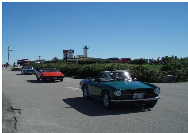
Last known sighting of PDQTR6 on the road.